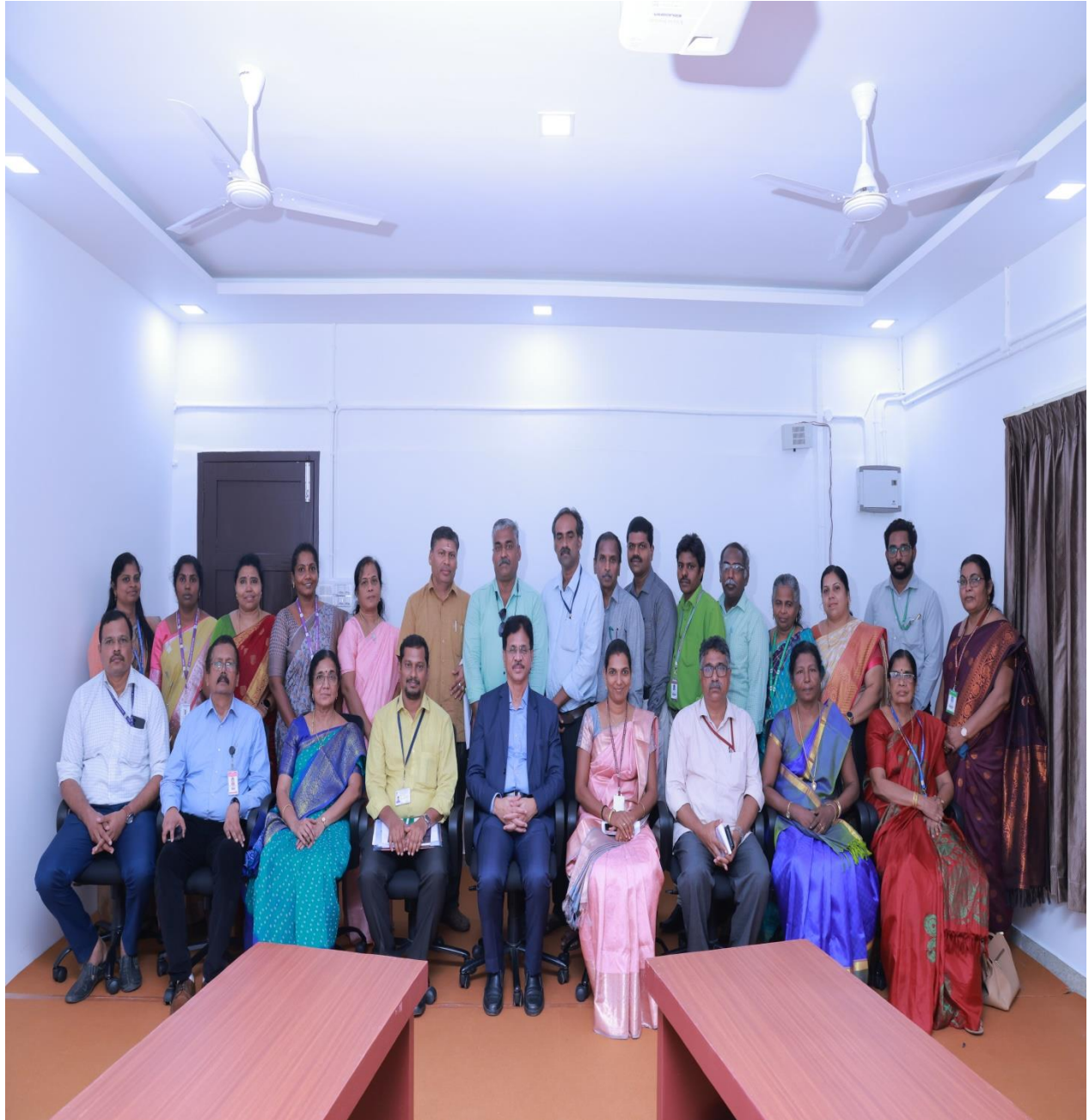
After interaction with the principals, a group photos were taken with the Vice-Chancellor and the team