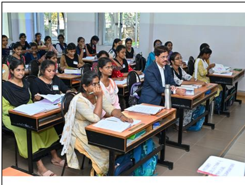
B.Sc(N) II YEAR CLASS ROOM

Demonstrating an interactive approach to learning, he invited one student to draw the human digestive system on the board. After the initial attempt, another student was asked to identify and rectify any inaccuracies in the diagram. Finally, a faculty member was asked to verify and elaborate on the corrections and he appreciated all of them.