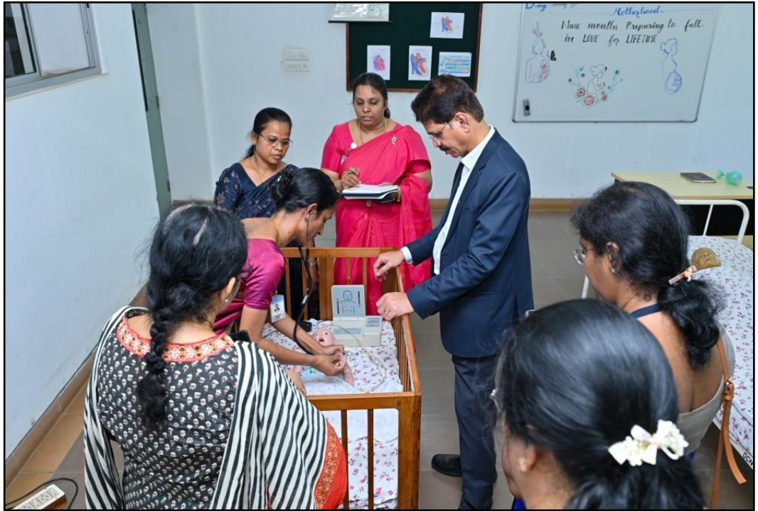
CHILD HEALTH NURSING LAB