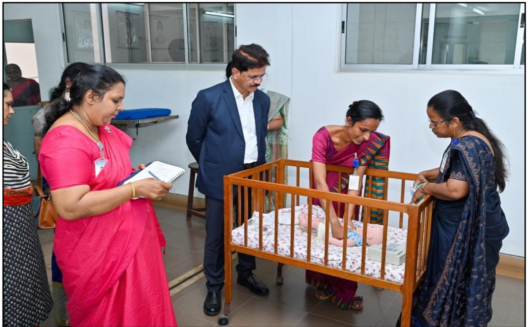
CHILD HEALTH NURSING LAB