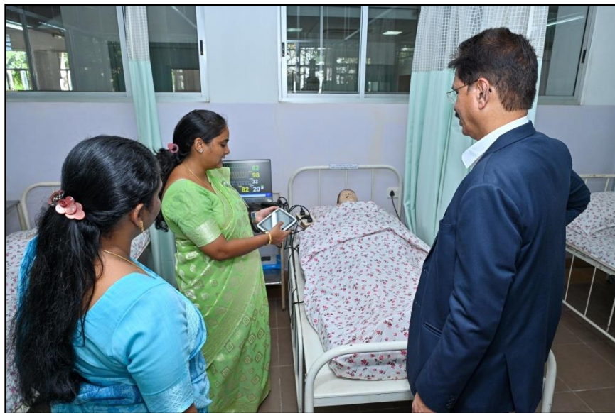
ADVANCED SKILL LAB

The Vice Chancellor inspected the process of conducting the simulation procedures using the advanced manikin. He explored the various procedures that can be done using the high fidelity manikins that was precisely explained by the faculty. His engagement with the pediatric staff to demonstrate newborn CPR and NG insertion procedures revealed a desire to ensure optimal resource allocation and the rigorous application of theoretical knowledge to practical scenarios and the faculty were appreciated for the same.